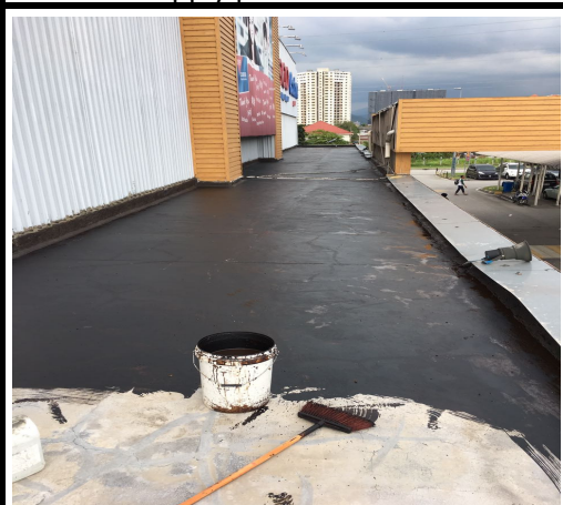
Photo 6 Applying of primer