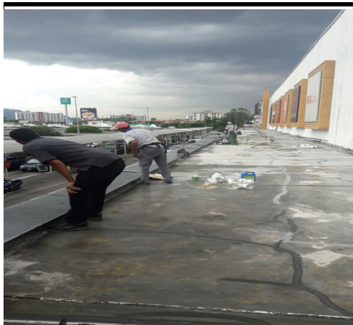
Photo 1 Wip View