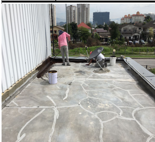
Photo 4 Wip View