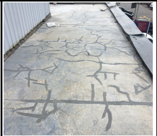
Photo 12 Crack repair