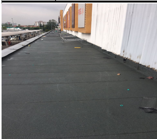
Photo 10 membrane work