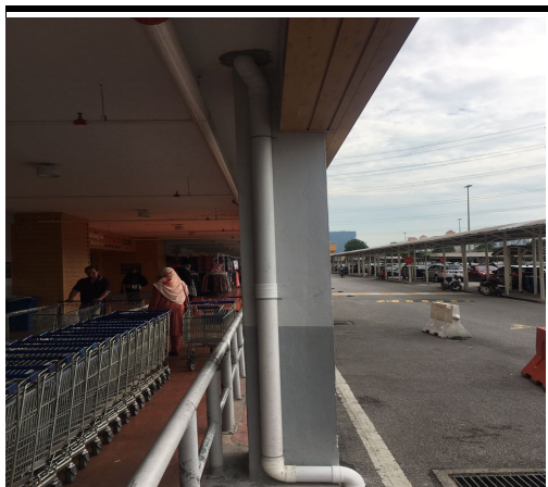
Photo 1 outlet installation