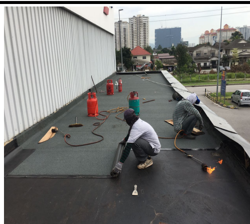
Photo 5 Torch on membrane work