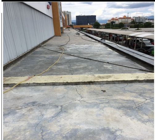
Photo 10 After cleaning