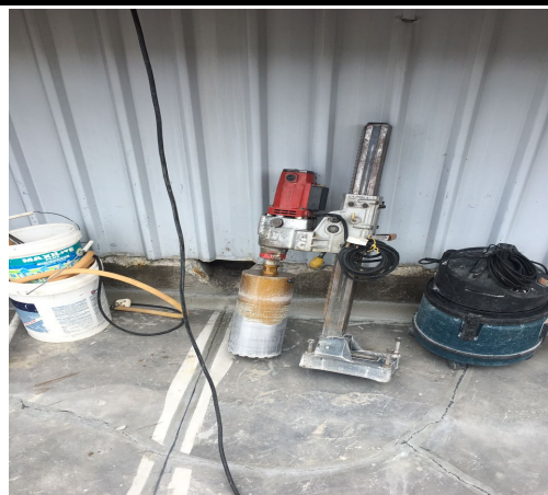
Photo 2 Coring work