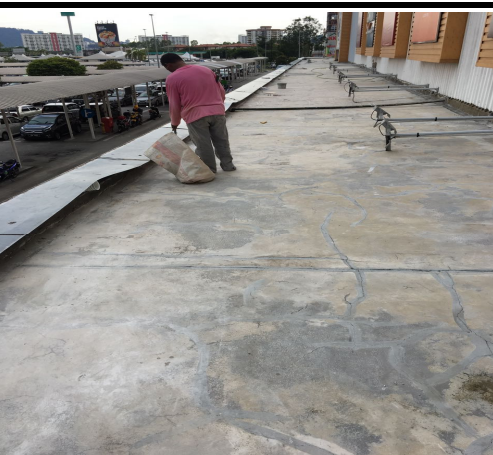
Photo 5 Cleaning before apply primer