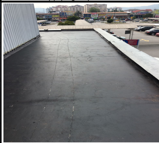
Photo 9 Primer curing