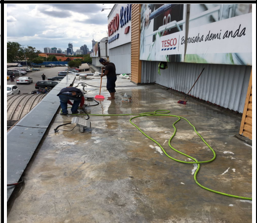
Photo 9 Site cleaning