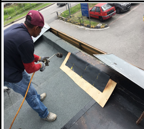
Photo 12 Torch-on membrane