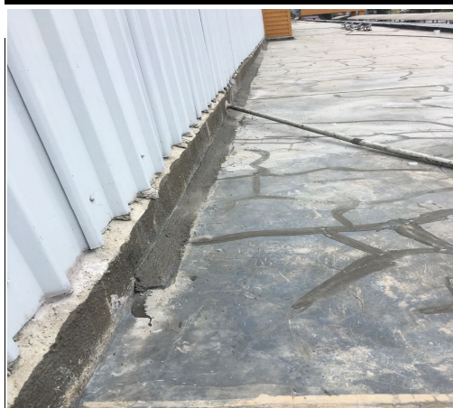
Photo 1 Angle fillet at all corner