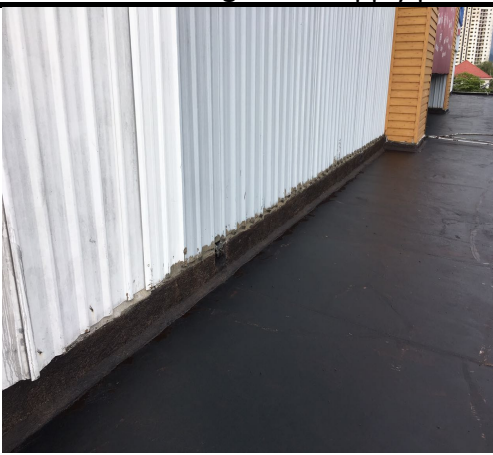
Photo 8 Primer application view