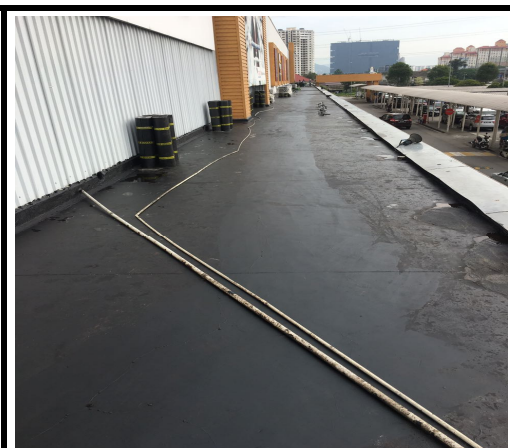
Photo 3 Touch up of bitumen primer