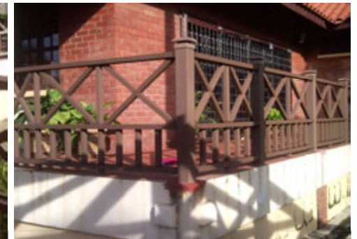
Photo 6 Another rear elevation of bungalow unit composite Railing duly completed view