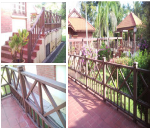
Photo 10 Chalet A, duly completed Composite Railing at Staircase and Rear Elevation view