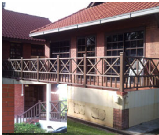
Photo 11 Chalet B Composite Staircase and Railing duly completed view