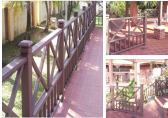
Photo 8 Bungalow Gazebo Composite Railing duly completed view