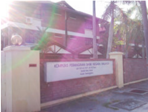
Photo 1 Bank Negara Malaysia Resorts Kuala Terengganu front entrance view