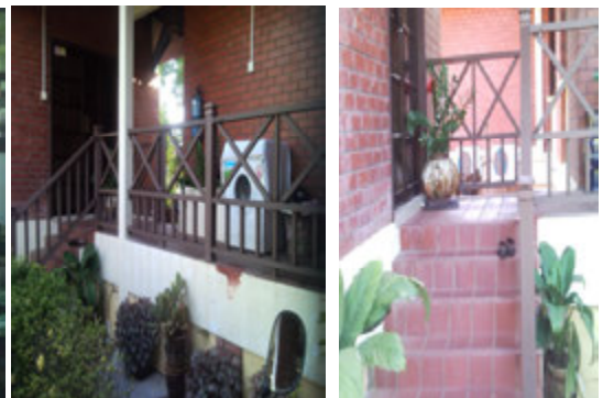
Photo 3 BNM Resort Bungalow next to caretaker's unit composite railing view