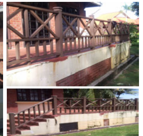
Photo 12 Chalet C Composite Railing and Staircase duly completed view