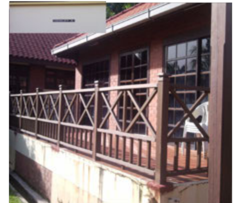
Photo 9 Chalet A rear elevation Composite Railing completed view