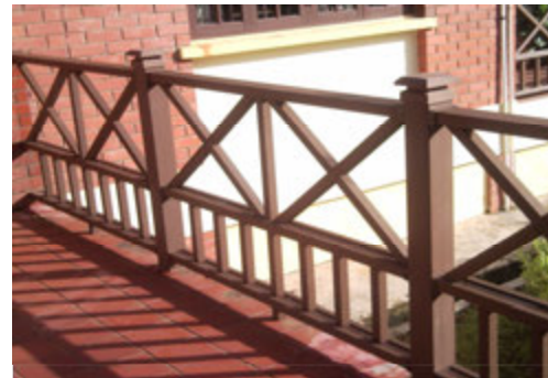
Photo 5 Bungalow unit Rear elevation of duly completed Composite Railing view