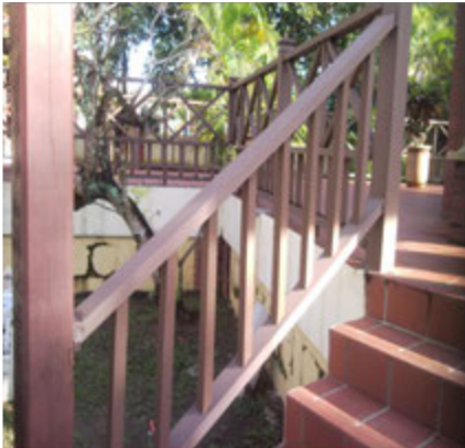
Photo 7 Another view of bungalow Gazebo Composite Railing