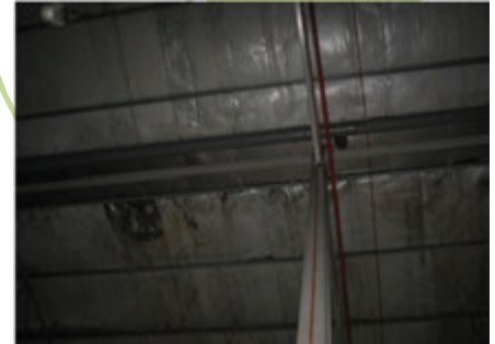
PHOTO 3 Another view of ceiling water stained from metal roof leakage