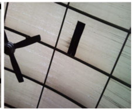
Photo 6 Another view of defective polycarbonate skylight view