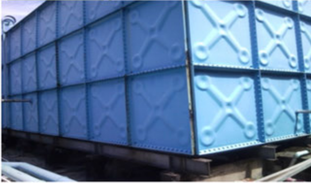
Photo 1 Front elevation of water tank view