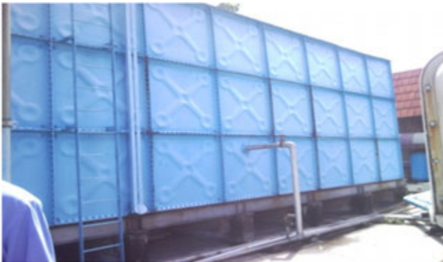
Photo 3 Side elevation of water tank view