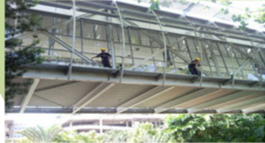
Photo 2 Another view of Hotel Abseiling cleaning system in progress...