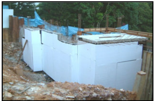
4. Installation of protection board prior backfilling.