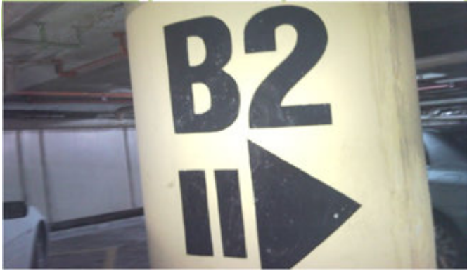
Photo 1 Car park basement B2 m/s c. l. pipes leakage