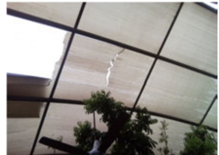
Photo 9 Garden Dome site cracked polycarbonate view