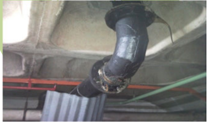
Photo 2 Existing elbow shape leakage / defective at double front fitting view