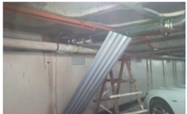
Photo 6 Front view of leakage piping