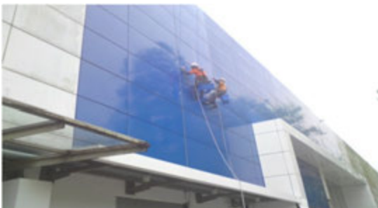
Photo 7 Hypermarket exterior abseiling cleaning system in progress...