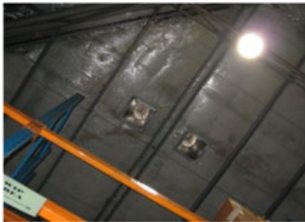
PHOTO 4 Below view of ceiling water stained from metal roof leakage