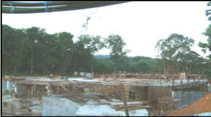
1. Basement retaining wall.