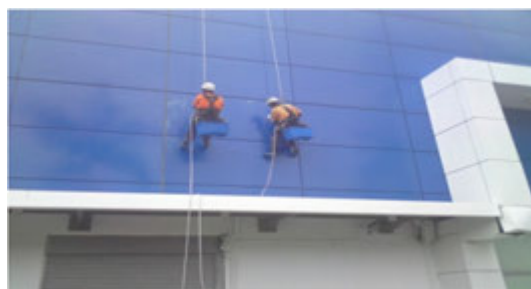
Photo 8 Hypermarket exterior window and panel cleaning system