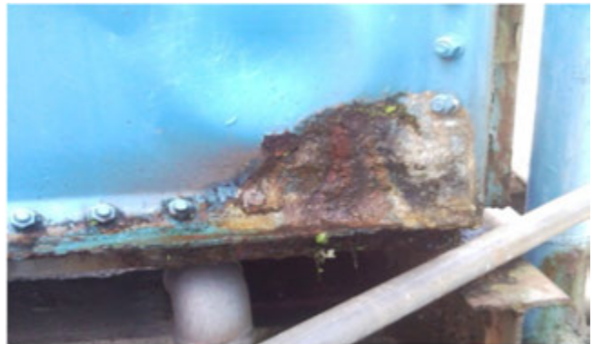
Photo 4 Another view of existing corroded and leakage water tank view