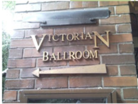
Photo 2 Victoria N Ballroom polycarbonate skylight defective view