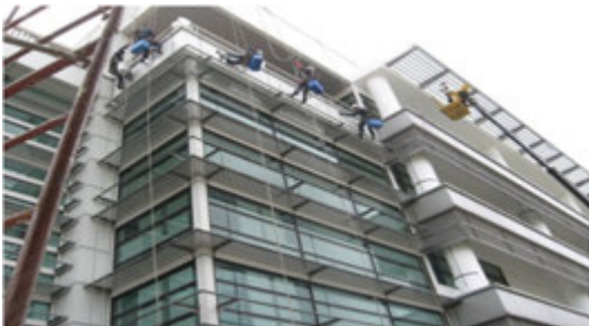
Photo 5 Commercial Abseiling cleaning system in progress...