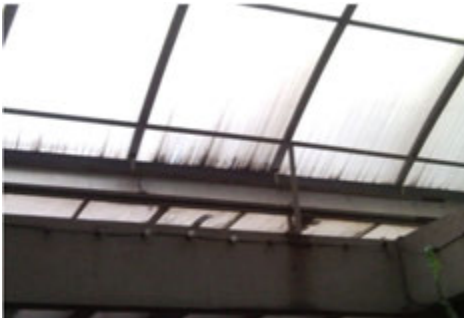
Photo 4 Side view of defective polycarbonate skylight view