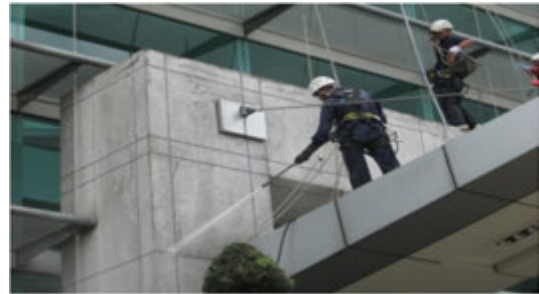
Photo 4 Commercial / Office complex Abseiling Cleaning System in progress...