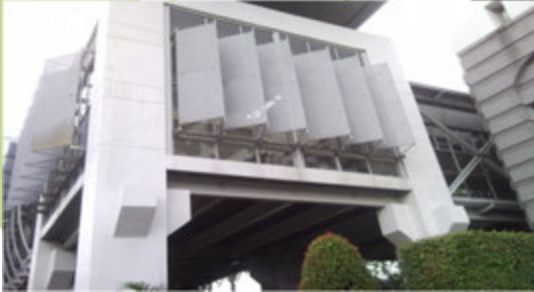
Photo 1 Hotel Glass Window Cleaning System