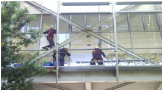
Photo 3 Hotel Cleaning System in progress...