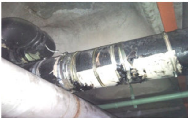
Photo 5 Another view of existing leakage c.l. pipes view at car park B2 area.