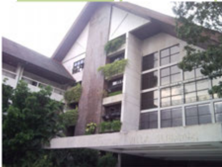
Photo 1 Front entrance at Holiday Villa Hotel & Resorts Subang View