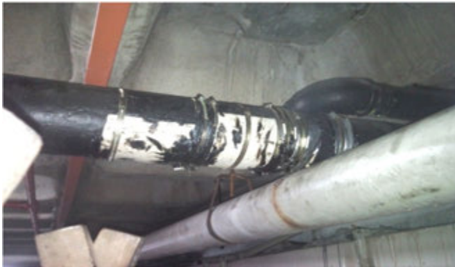
Photo 3 Side view of c.l. piping leakage at car park B2 area