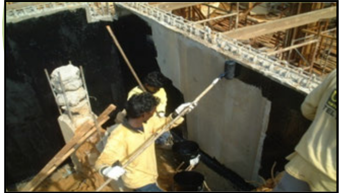
2. Application of 1 st coat waterproofing membrane.