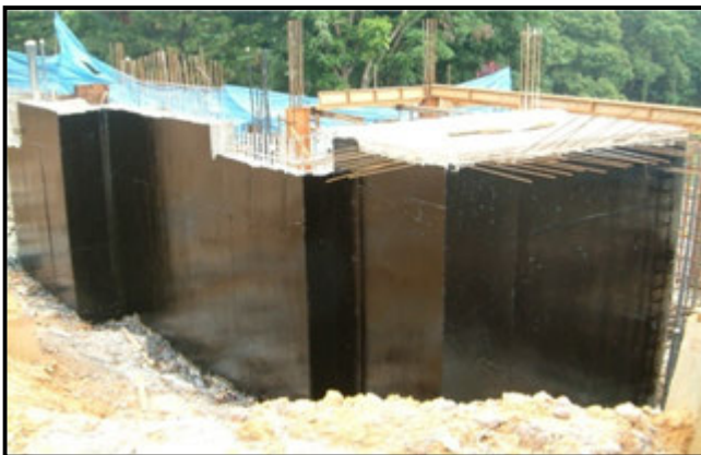
3. Completion of waterproofing membrane.