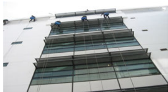
Photo 6 Glass and arocarbon abseiling cleaning system in progress...