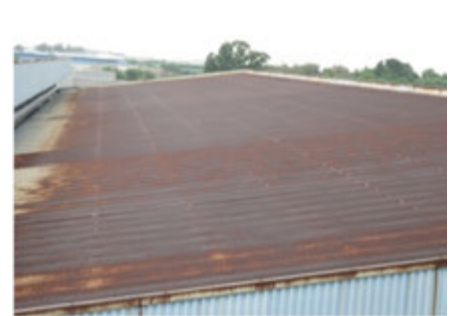
PHOTO 6 Another view of defective metal roof