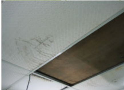
PHOTO 1 Ceiling water stained from metal roof leakage view