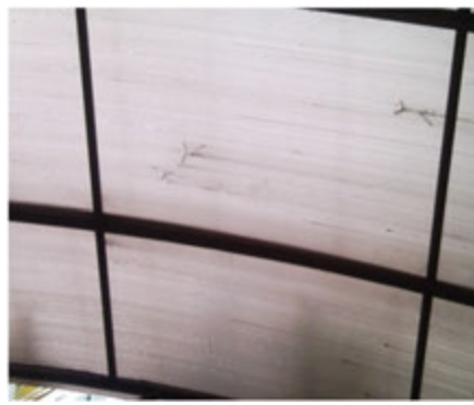
Photo 8 Top view of defective polycarbonate skylight at garden dome site