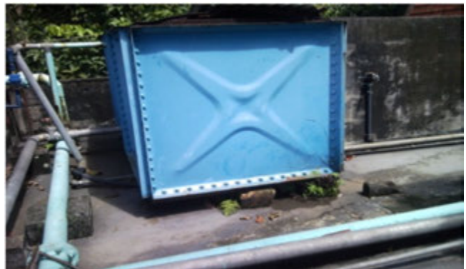
Photo 6 Another view of smaller water tank corroded view