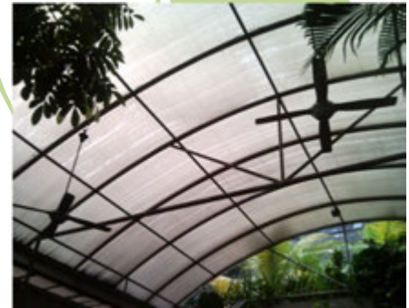
Photo 3 General view of Garden Dome Site of defective polycarbonate skylight