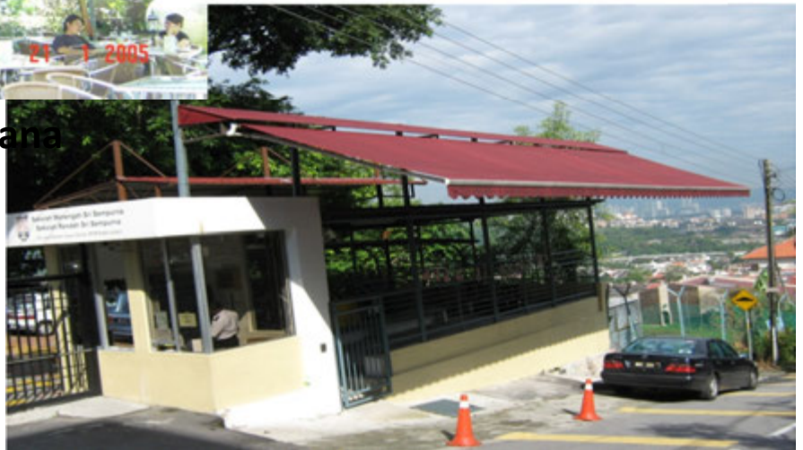
Sri Sempurna School, Cheras