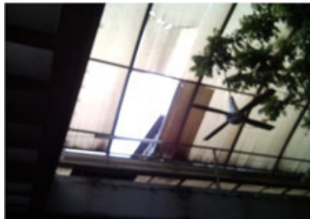
Photo 5 Cracked / defective polycarbonate skylight view at garden dome area