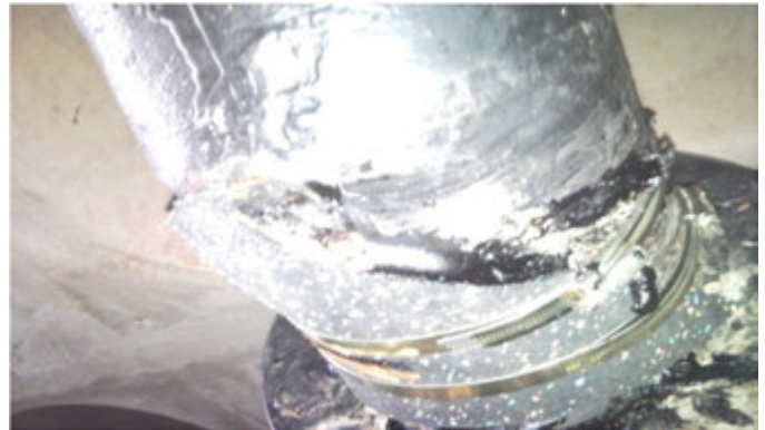
Photo 4 Another view of existing leakage c.l. pipes view at car park B2 area.