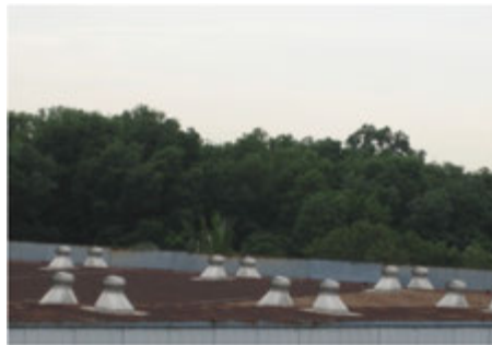
PHOTO 5 Top view of defective metal roofing