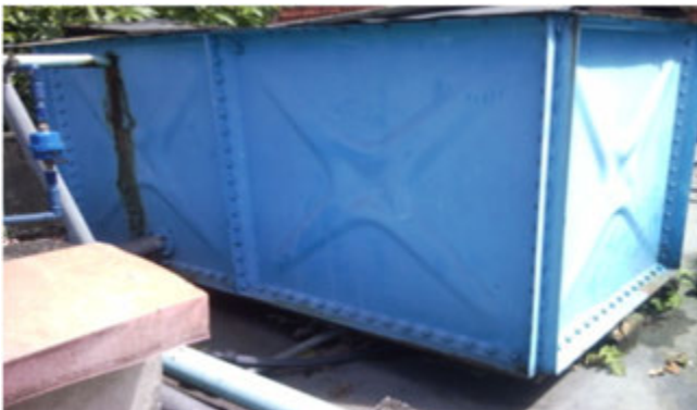
Photo 5 Smaller water tank view