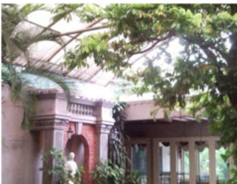
Photo 7 Another view of garden dome site defective polycarbonate skylight view