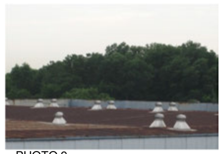
PHOTO 9 Side view defective metal roof