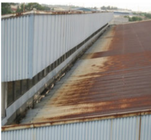
PHOTO 7 Ceiling water stained from metal roof leakage view