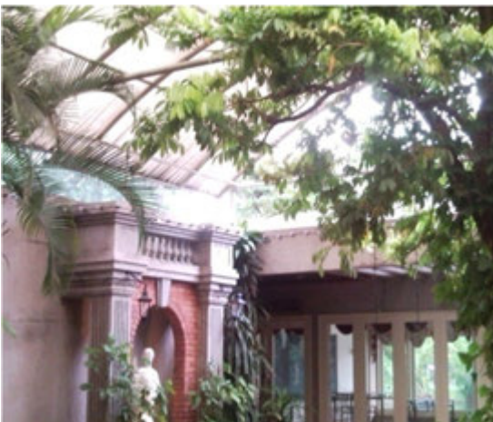
Photo 7 Another view of garden dome site defective polycarbonate skylight view