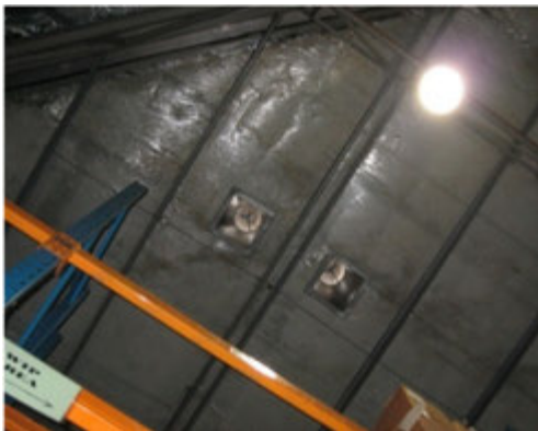
PHOTO 4 Below view of ceiling water stained from metal roof leakage