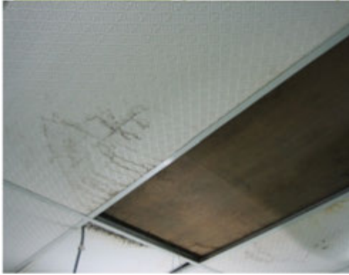
PHOTO 1 Ceiling water stained from metal roof leakage view