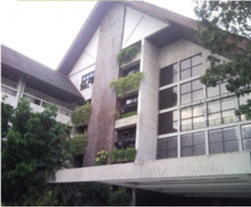
Photo 1 Front entrance at Holiday Villa Hotel & Resorts Subang View