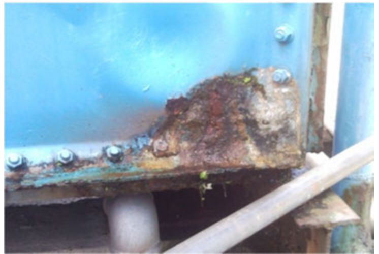
Photo 4 Another view of existing corroded and leakage water tank view