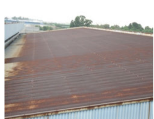
PHOTO 6 Another view of defective metal roof