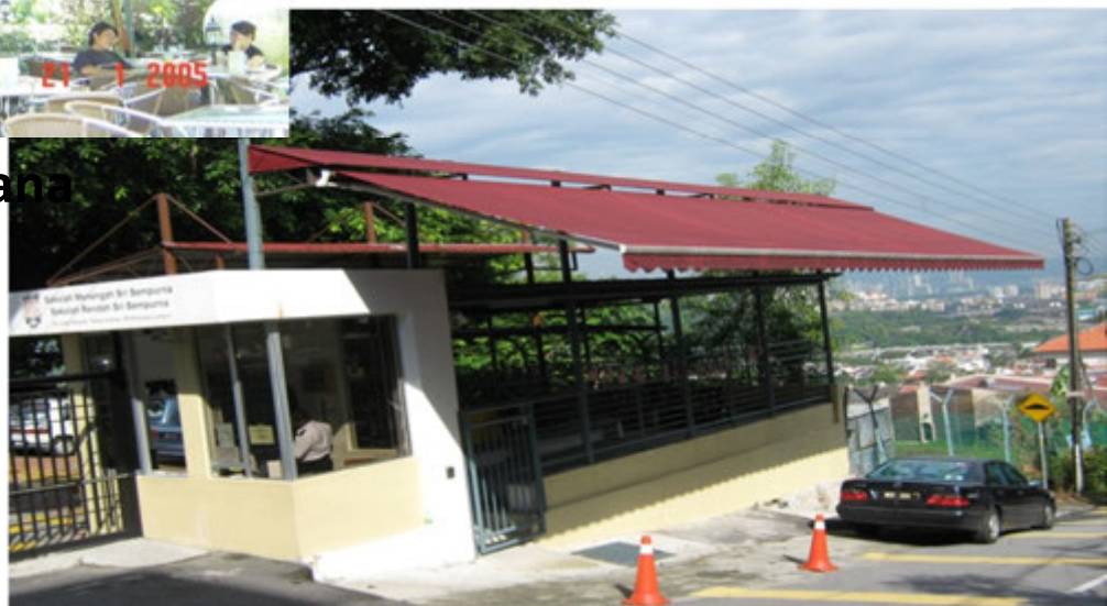
Sri Sempurna School, Cheras