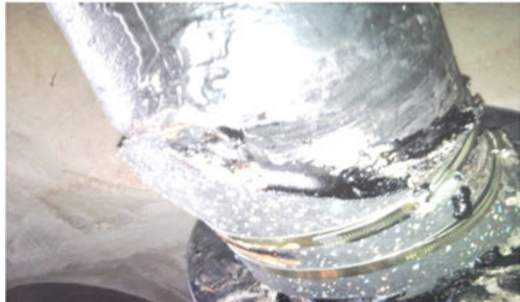
Photo 4 Another view of existing leakage c.l. pipes view at car park B2 area.