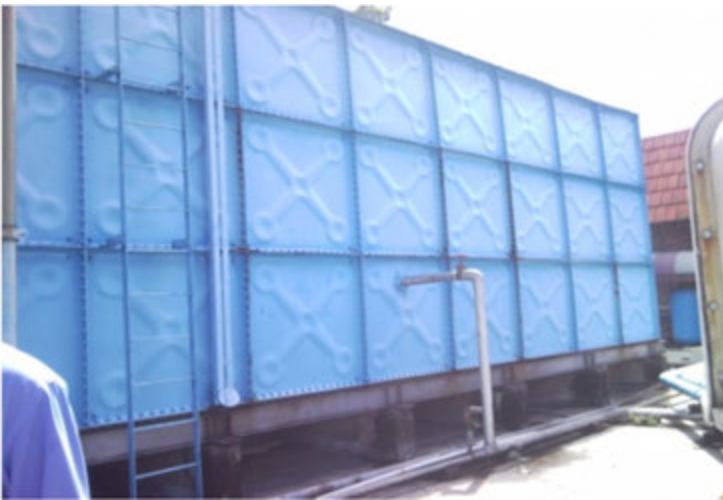
Photo 3 Side elevation of water tank view