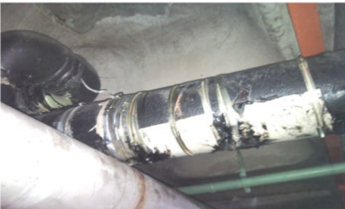
Photo 5 Another view of existing leakage c.l. pipes view at car park B2 area.