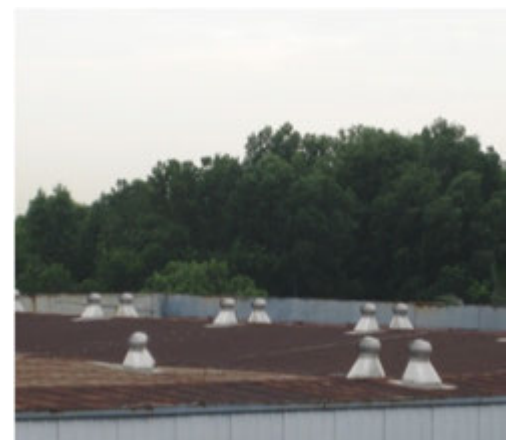
PHOTO 9 Side view defective metal roof