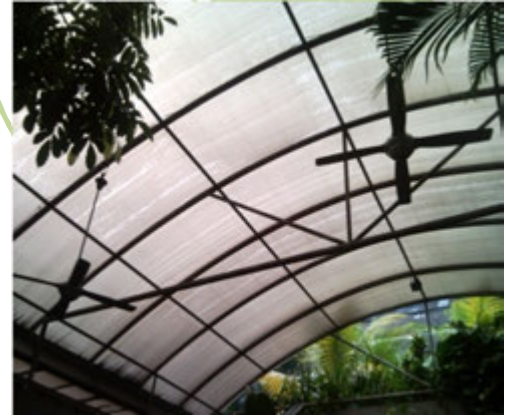
Photo 3 General view of Garden Dome Site of defective polycarbonate skylight