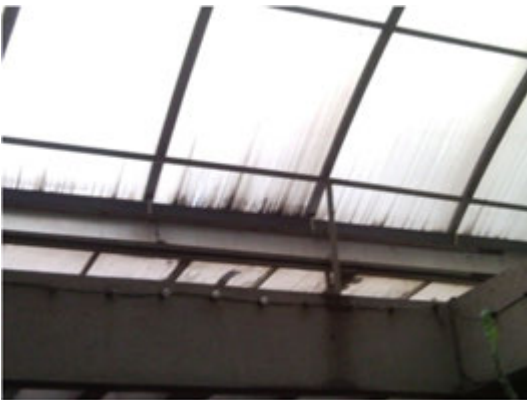
Photo 4 Side view of defective polycarbonate skylight view