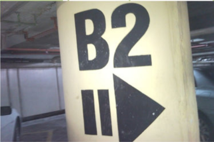
Photo 1 Car park basement B2 m/s c. l. pipes leakage