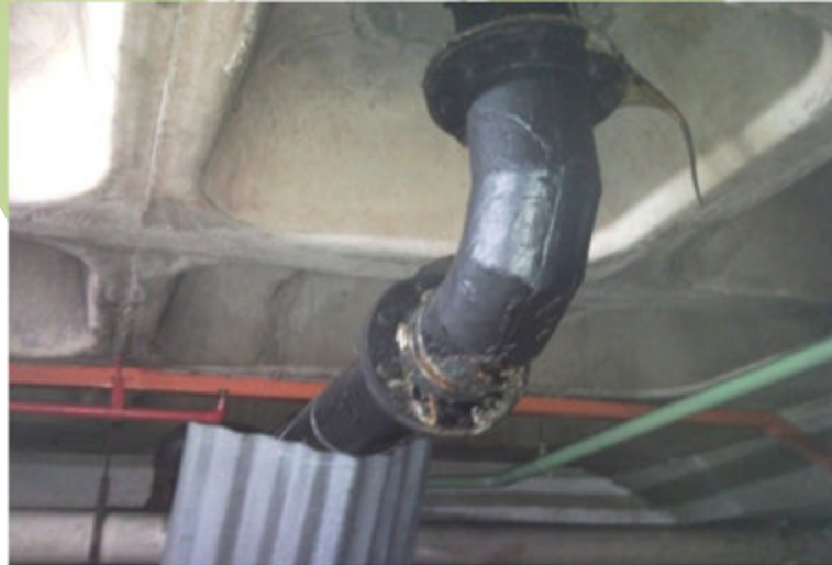
Photo 2 Existing elbow shape leakage / defective at double front fitting view