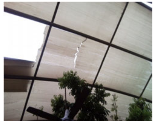
Photo 9 Garden Dome site cracked polycarbonate view