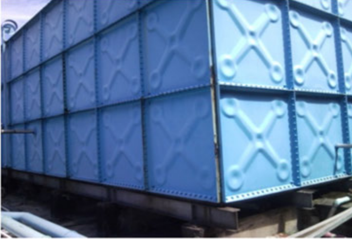
Photo 1 Front elevation of water tank view