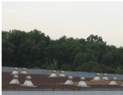
PHOTO 5 Top view of defective metal roofing