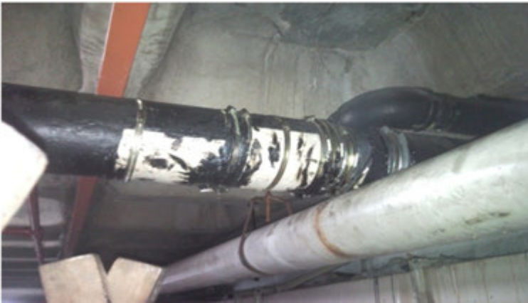
Photo 3 Side view of c.l. piping leakage at car park B2 area