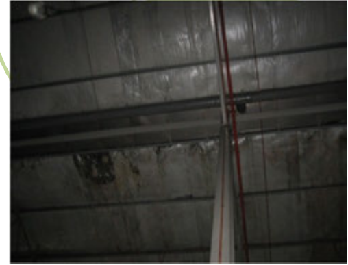
PHOTO 3 Another view of ceiling water stained from metal roof leakage