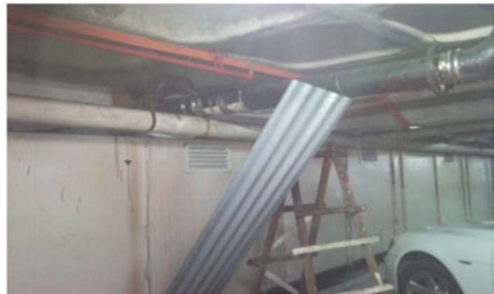
Photo 6 Front view of leakage piping