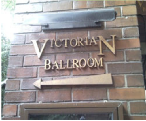
Photo 2 Victoria N Ballroom polycarbonate skylight defective view