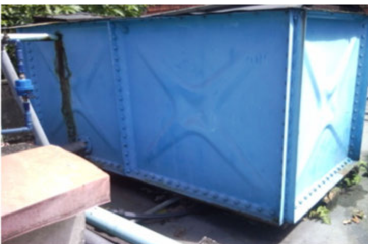
Photo 5 Smaller water tank view