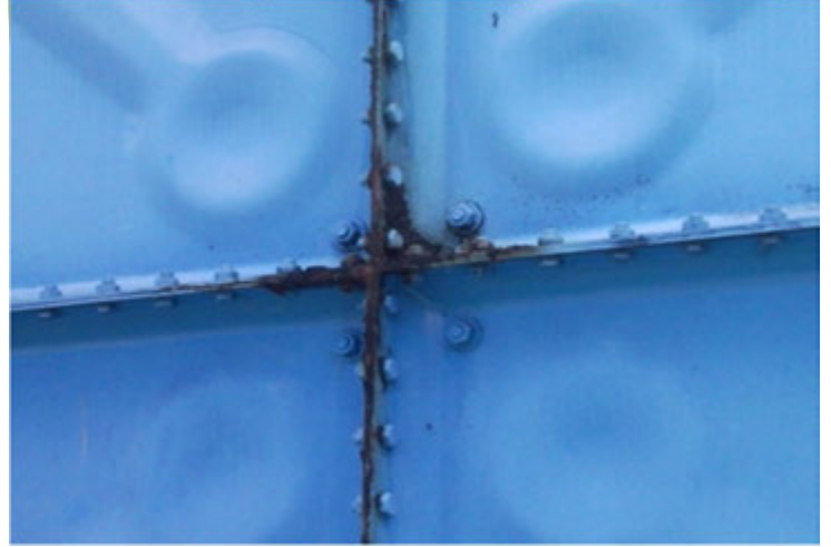
Photo 2 Corroded exterior water tank view