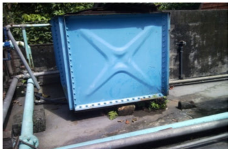
Photo 6 Another view of smaller water tank corroded view