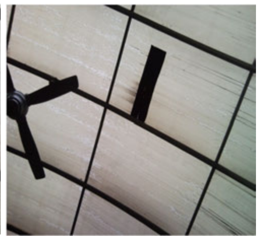
Photo 6 Another view of defective polycarbonate skylight view