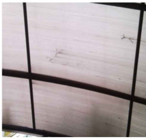
Photo 8 Top view of defective polycarbonate skylight at garden dome site