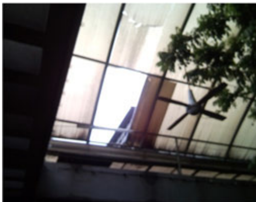
Photo 5 cracked / defective polycarbonate skylight view at garden dome area