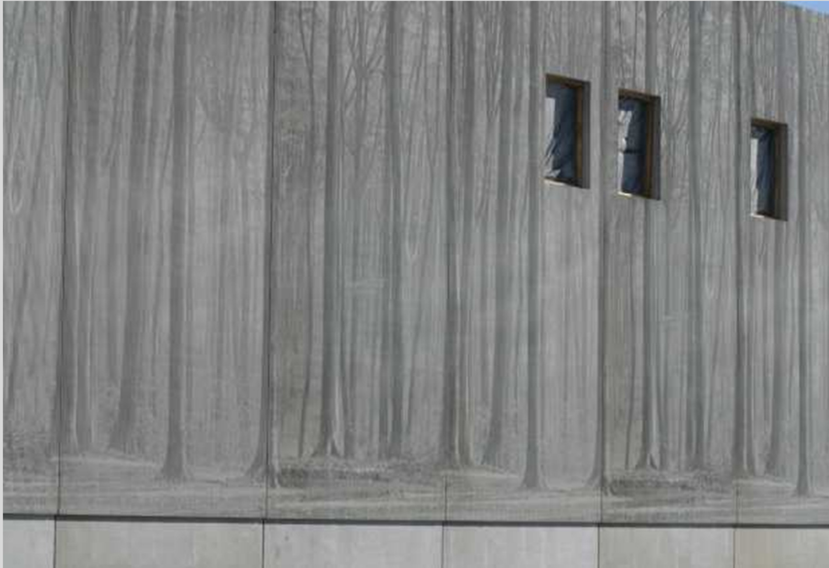
Building, Amsterdam, Netherlands