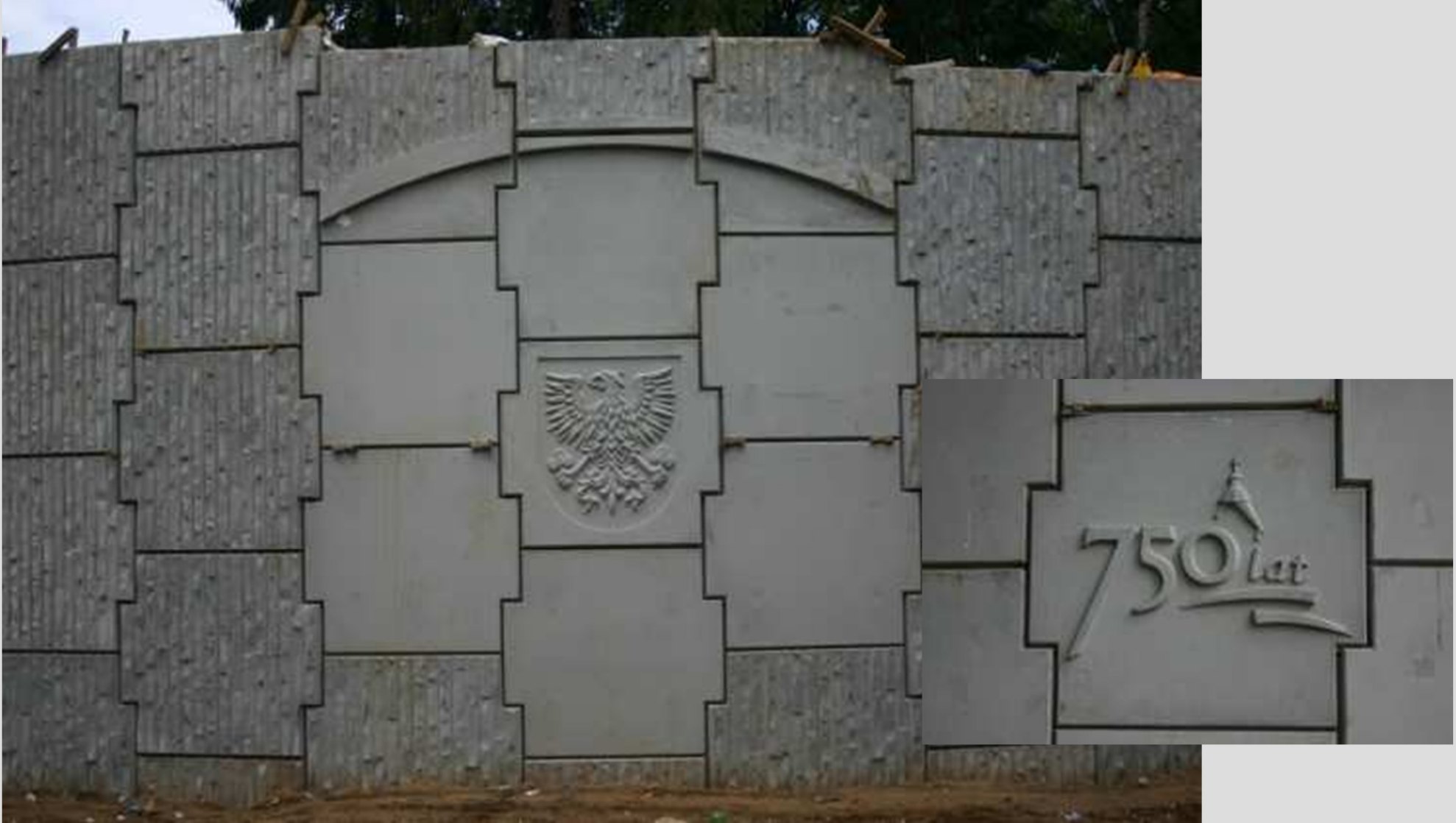
Retaining wall system Reinforced Earth, Poland