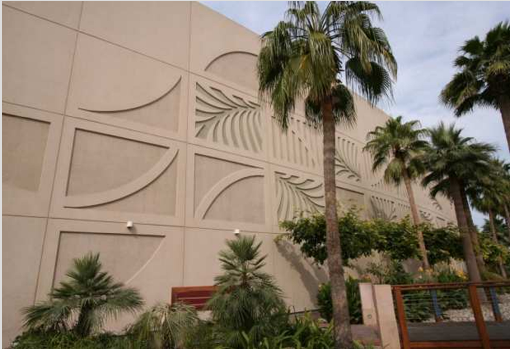
Hyatt Hotel, Dubai, UAE