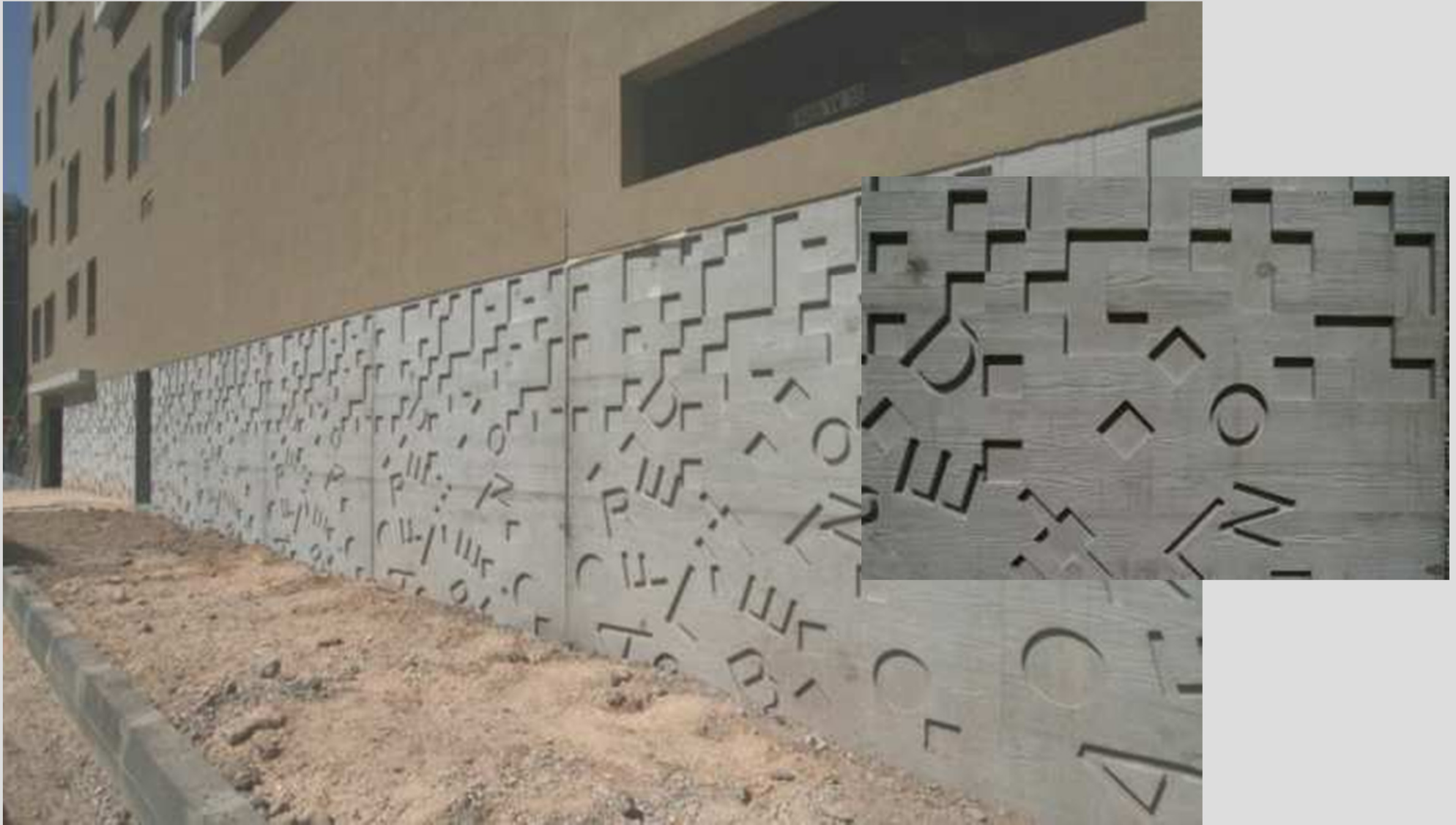
Building in Toulon, France, 2/23 Alster