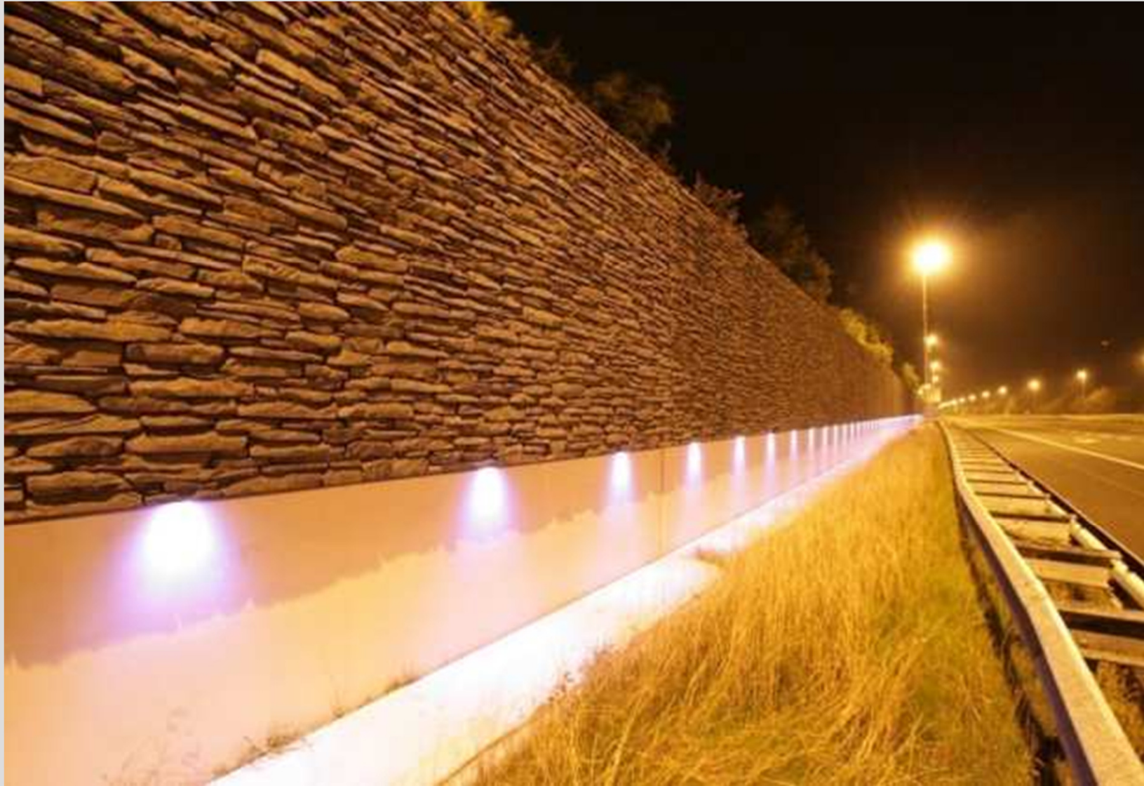
Noise-absorbing wall, Doetichem, Netherlands, 2/164 Brabant