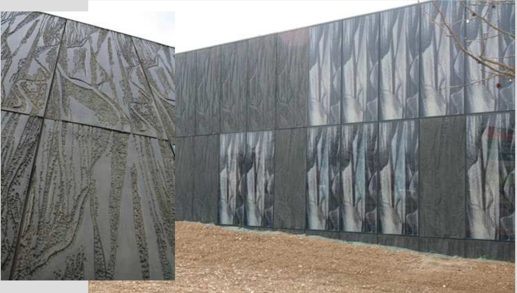
Floral pattern, Museum, Ingres, France