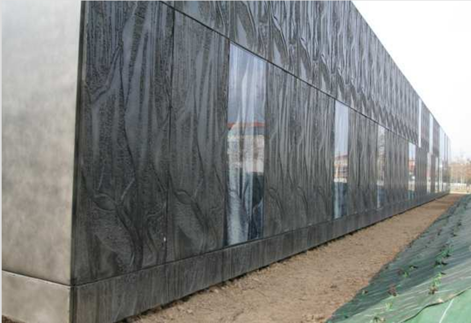
Floral pattern, Museum, Ingres, France