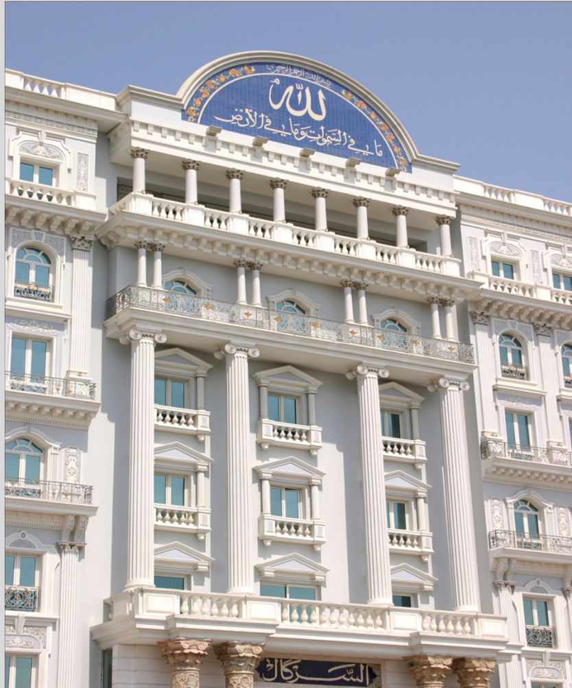
UAE - Dubai - Al Serkal Building