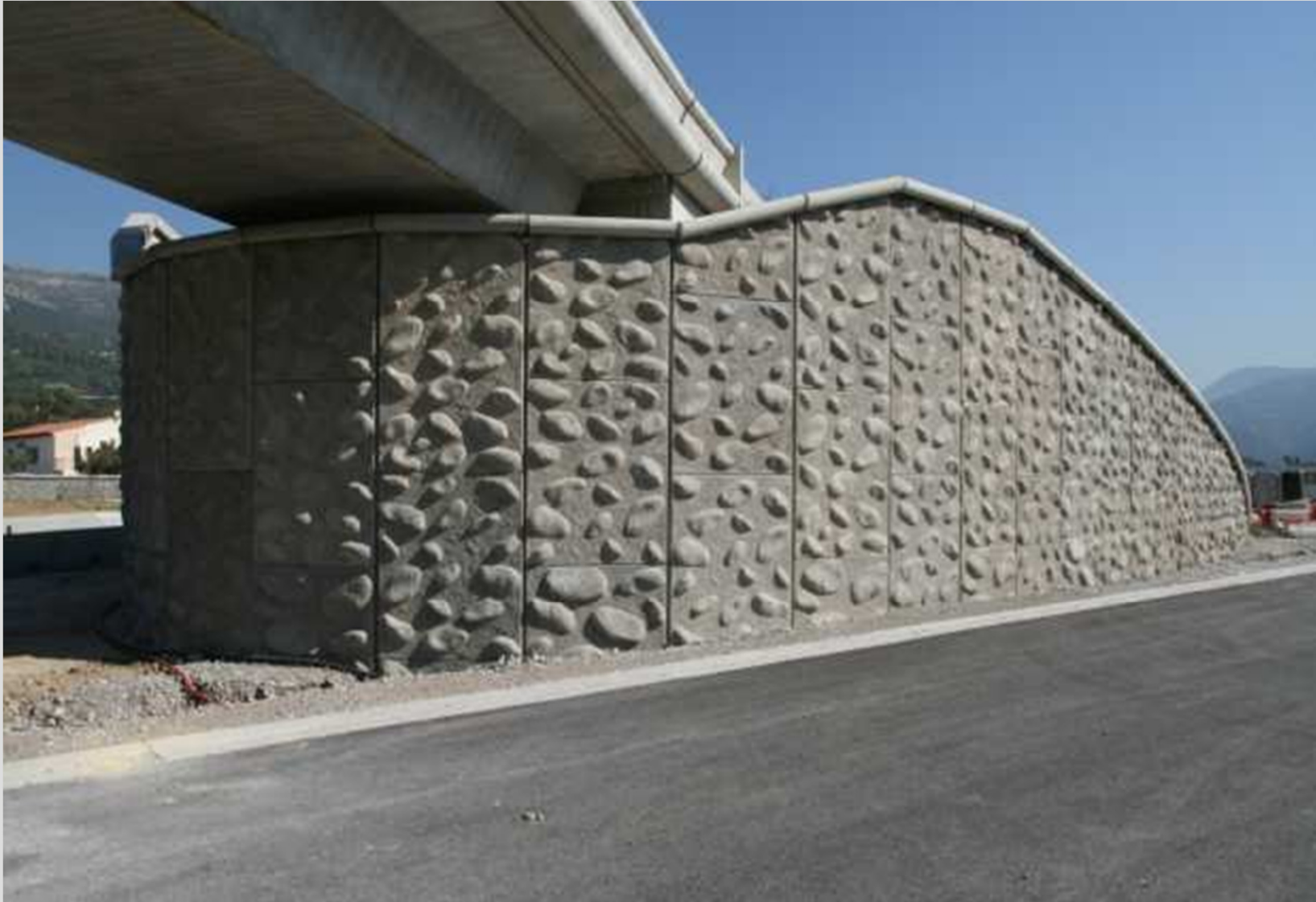
Bridge system Reinforced Earth, Nice, France