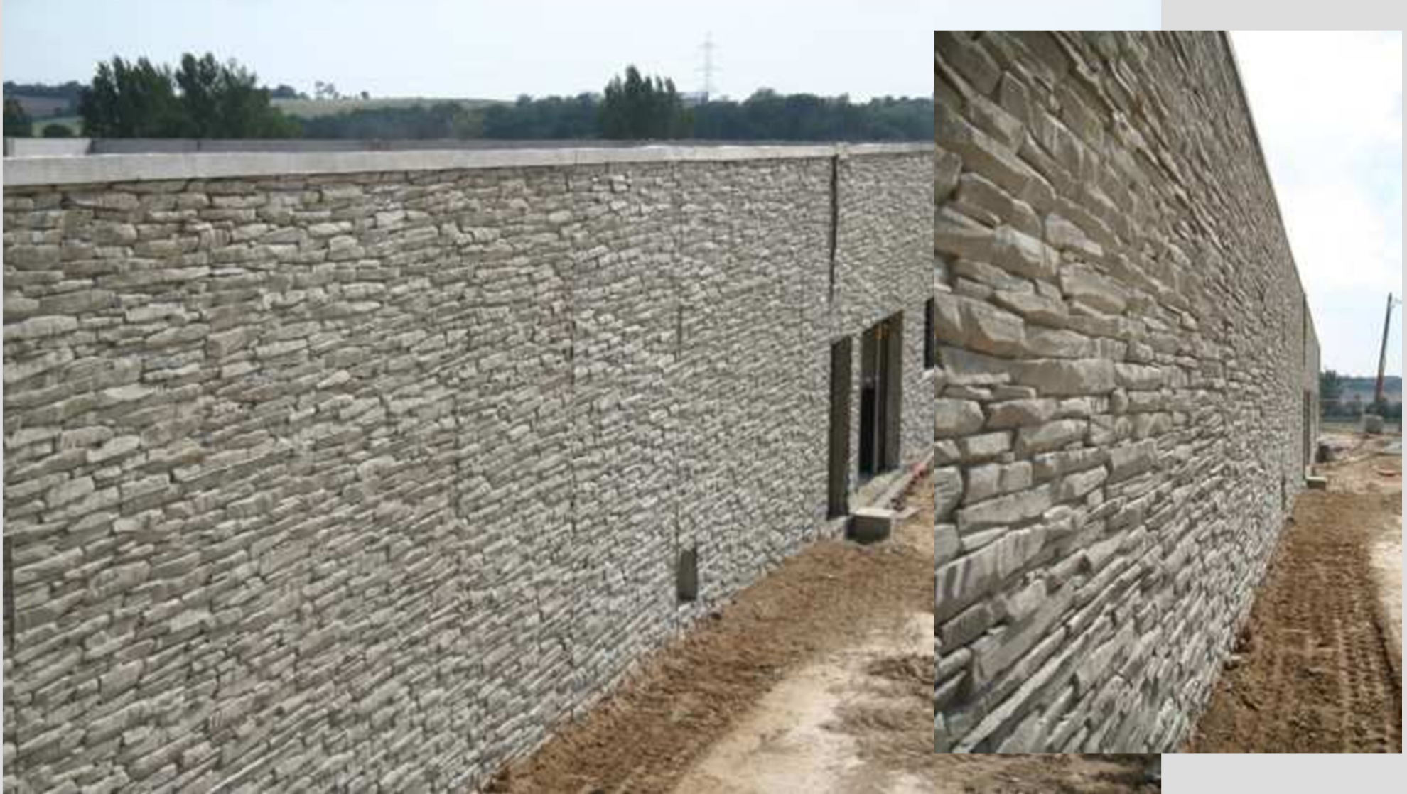
Building, Toulouse, France, 2/164 Brabant