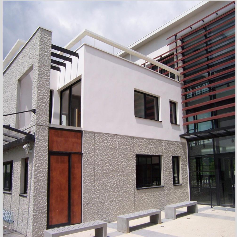
3é collège 93 livry gargan