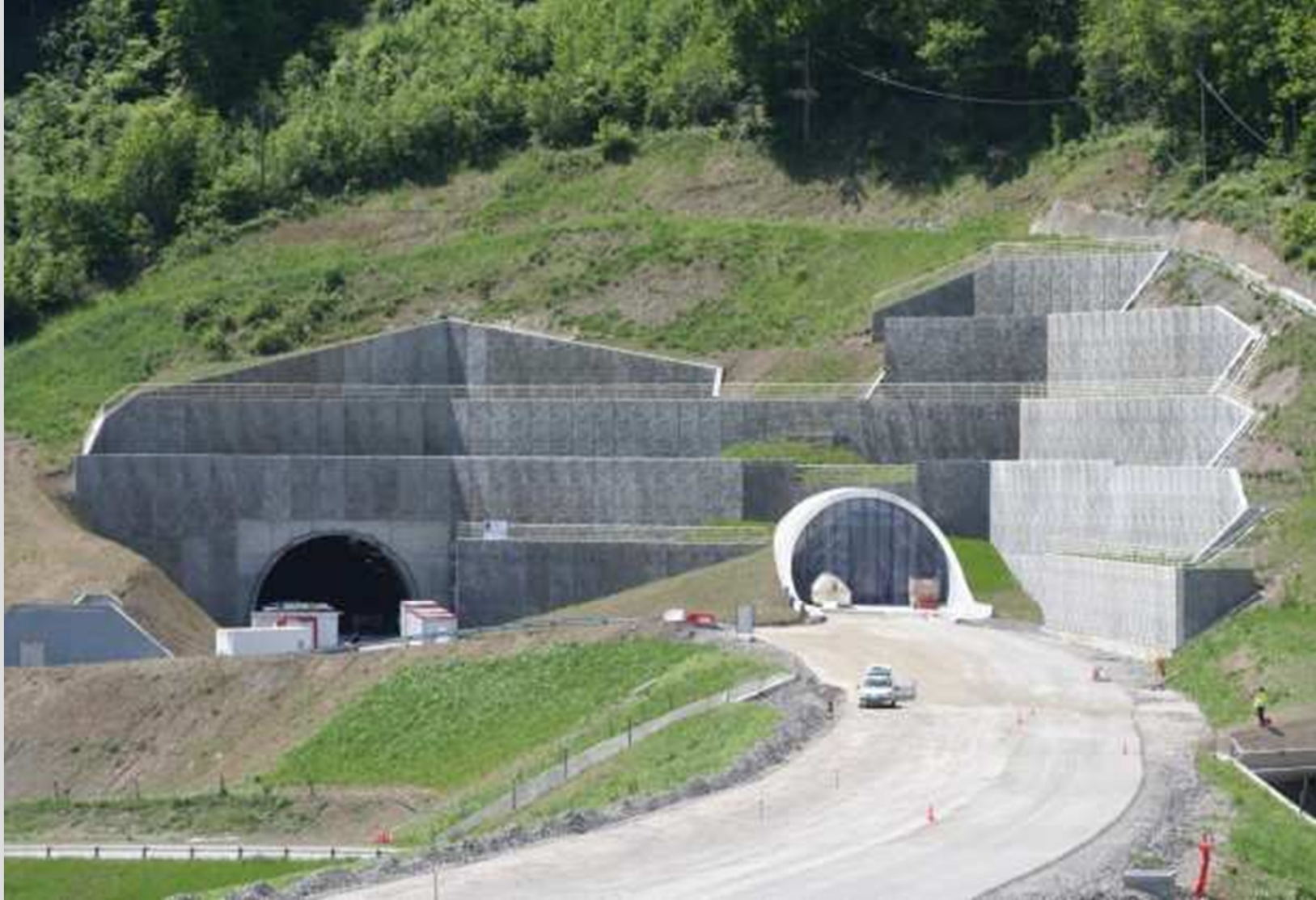
Sinard Tunnel, A 51, France, 2/121 Cheyenne